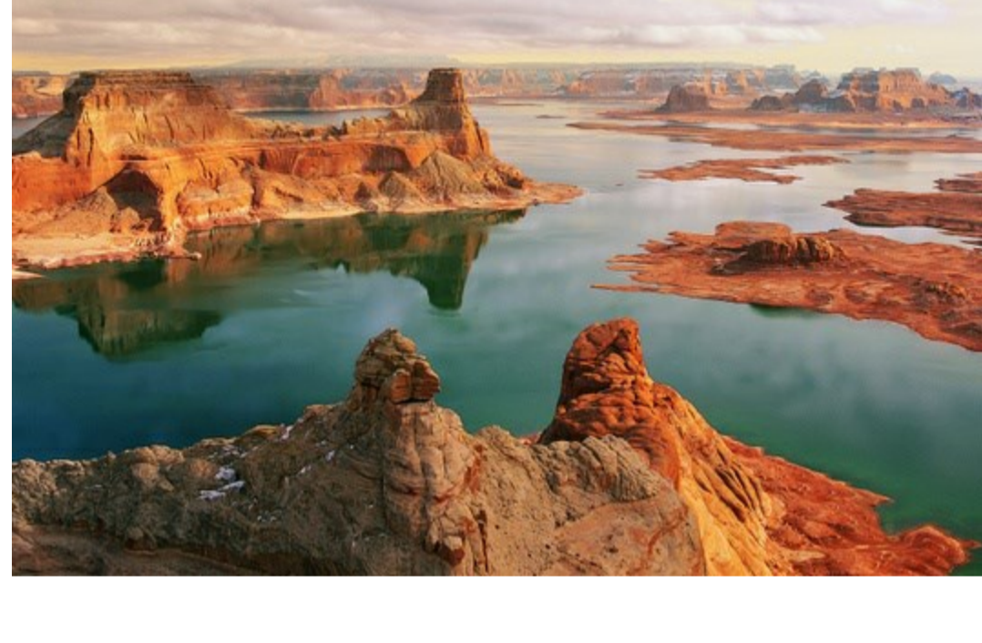
Lake Powell, Arizona.