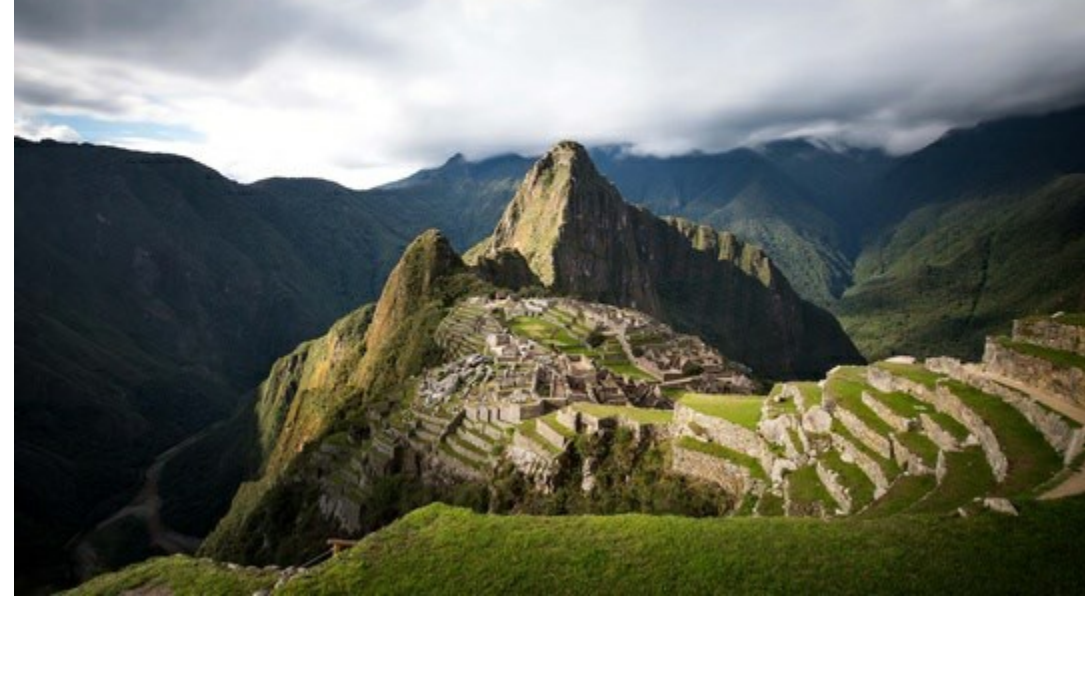
The Incan citadel of Machu Picchu, high in the Andes Mountains, Peru.