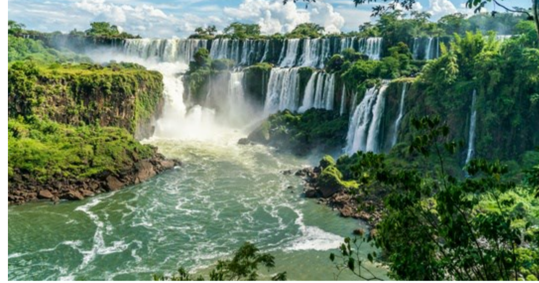
Iguazu Falls, Argentinian National Park, Argentina.